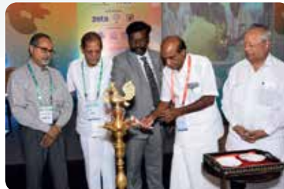
Lamp Lighting by Dignitaries