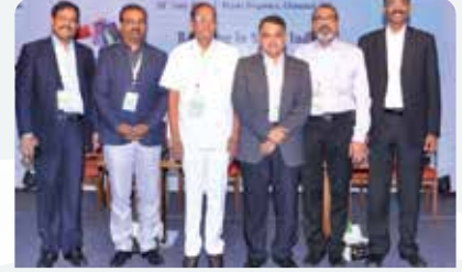
Members of the RAI Southern Regional Council