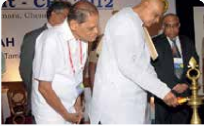
Dr. K. Rosaiah, His Excellency The Governor of Tamil Nadu